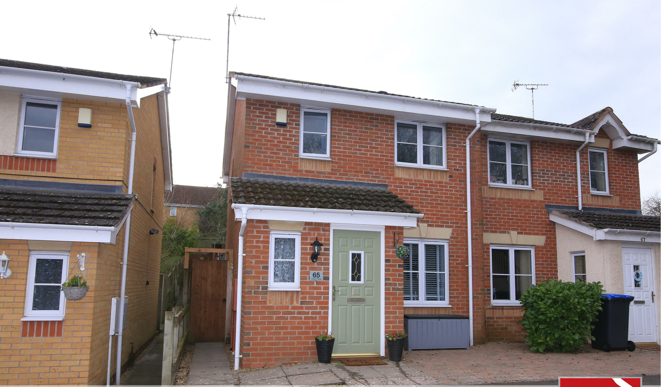
Viaduct Close, Rugby, Warwickshire Guide Price £235,000